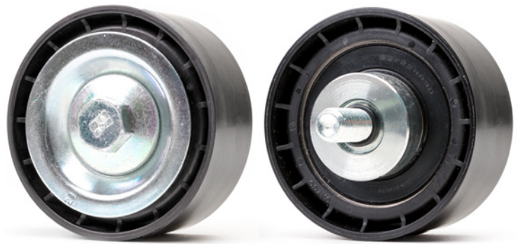
Figure 1: Previous design

Both comply with the technical specifications and can be used without restrictions.